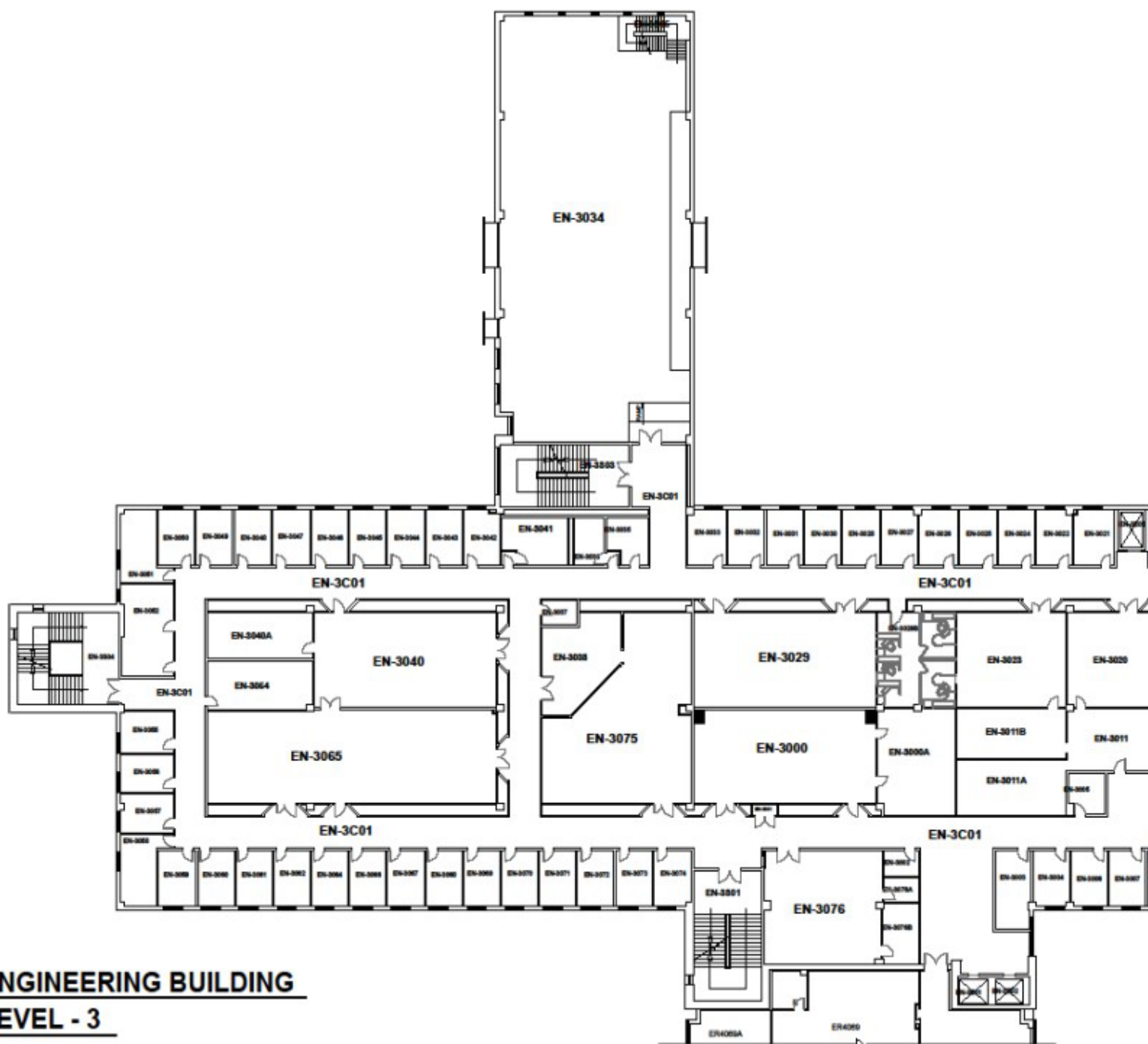
ENGINEERING BUILDING LEVEL - 3